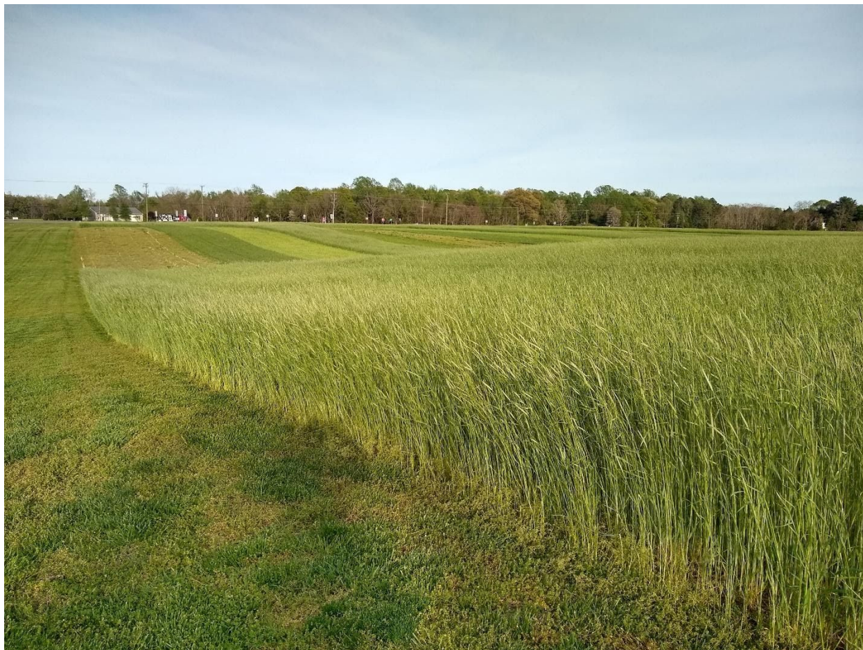
Figure 1. View of cover crop plots on April 18 th prior to burndown and planting of full-season soybeans.