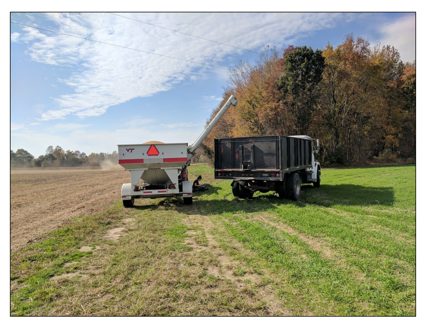
MATURITY GROUP 5 VARIETY COMPARISONS