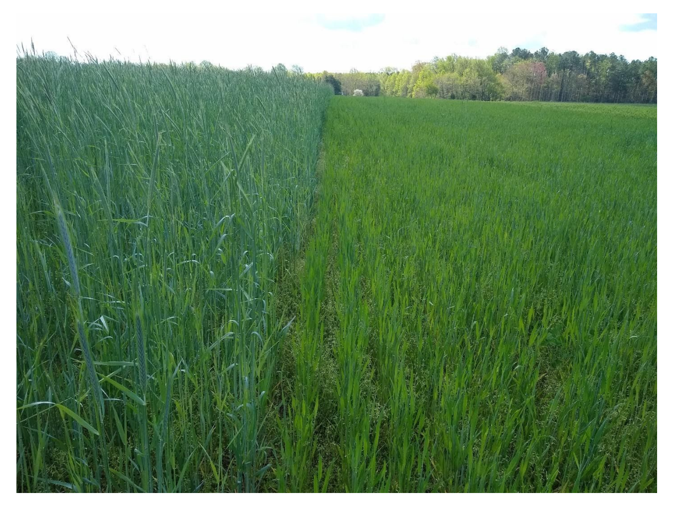
Figure 1. View of rye and wheat cover crops prior to burndown in April 2020

Cover crops were terminated using herbicides in mid-April. Full-season soybeans were planted with a no-till drill on May 15th. A good stand of soybeans was obtained in all treatments. After a dry spell from June 25<sup>th</sup> to July 21<sup>st</sup>, growing conditions were very good. Harvest was somewhat delayed due to damp conditions, but seed quality was very good and no excessive shattering losses were noted. Overall yields were very good in all treatments. This was only a demonstration plot so no hard conclusions should be made from the results. We encourage farmers to continue to experiment with cover crops to help them determine how they can fit into their cropping systems.