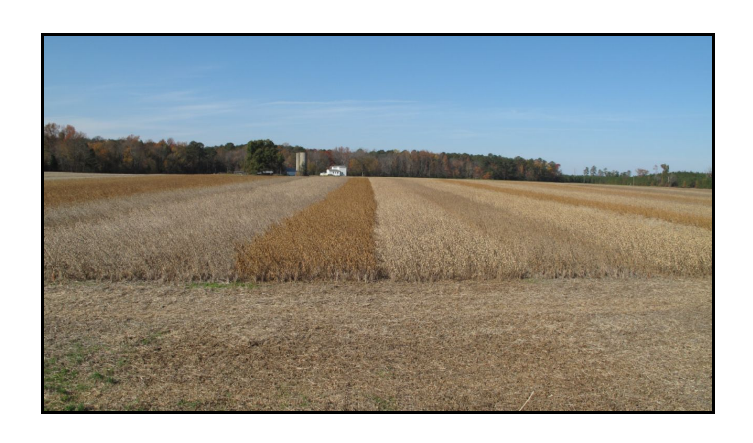
MATURITY GROUP 4 VARIETY COMPARISONS