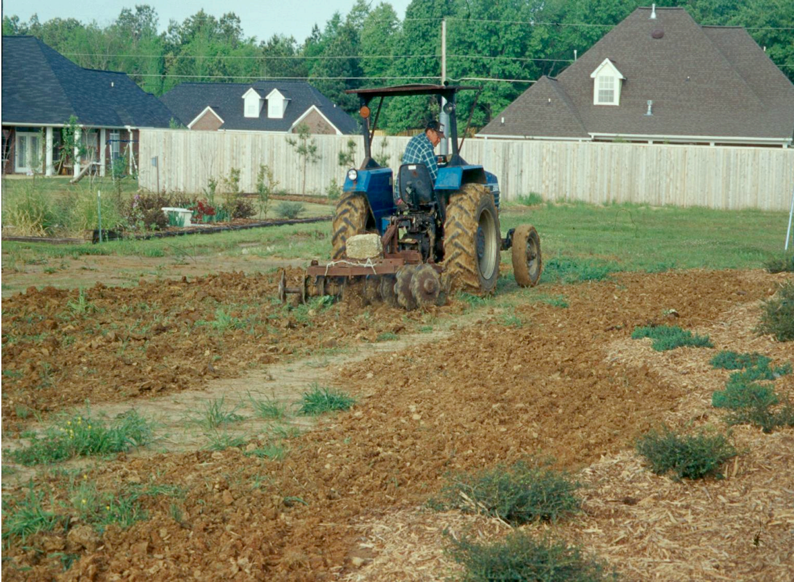
Figure 1. Tilling the soil is critical for success, but leaving some clods is preferred as compared to pulverizing the existing soil into powder.

Initial irrigation and mowing strategies. After planting seed, irrigate lightly and frequently until seed germination is complete. Avoid excessive amounts of water because this could either wash away or drown the seed. As establishment progresses, gradually cut back on the amount of water applied in order to start promoting a deep root system. The irrigation philosophy is similar for sod and plug establishment, but larger amounts of water can be applied less frequently because these plant materials have soil and some root mass intact. The initial irrigation strategy for sprigs is to keep the sprigs essentially saturated until rooting is initiated. Then reduce watering requirements as described above. For further discussion on irrigation management during the summer consult VCE Publication 430-010 Summer Lawn Management: Watering the Lawn at http://www.cses.vt.edu/html/Turf/turf/publications/publications_page.html .