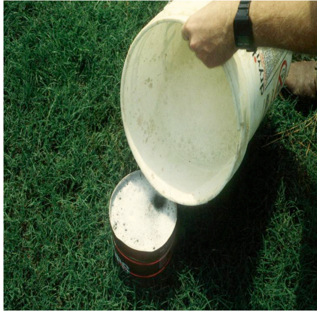
Figure 11. A soap flush used to aid in the identification of surface insect pests.

The most significant insect pest to attack Virginia turfgrasses is most often the grubworm or white grub. When disturbed in the soil the grub will curl into a “C” shape and lay motionless for a brief period as pictured in Figure 12. White grubs are the larval stages of several different scarab beetles and they come in many different sizes ranging from less than 0.25 inch in length for grubs of the Black Turfgrass Aetiniid to over 1 inch in length for the grubs of the Green June beetle. Most grubs have an annual life cycle similar to that pictured in Figure 12. Grubs feed on turfgrass roots with chewing mouthparts. Because of the damage to the roots, the most noticeable symptom is wilting of the turf during dry periods.