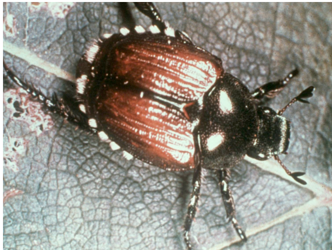
Figure 14. The adult Japanese beetle, a significant pest on many landscape plants.

spring they will reach their maximum size as worms before they go through their final metamorphosis from grub to beetle. Due to their size, chemical control is very difficult at this time. As winged, adult beetles emerge, most are only interested in mating in order to lay eggs for the next generation. However, the Japanese beetle (Figure 14) is a serious adult pest, feeding on many trees, shrubs, ornamentals, and vegetables around the landscape. The adults are often treated with insecticides for the damage they cause on these plants, but control of the adults is still fairly inconsequential regarding grubs that will attack turfgrass root systems.