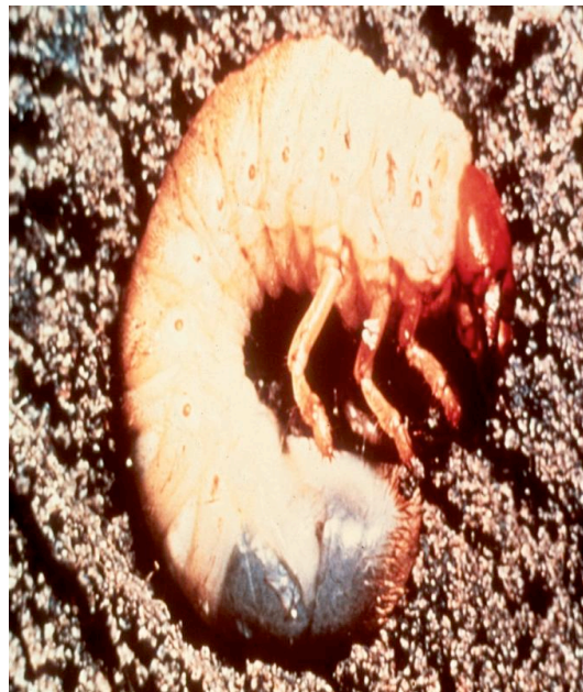
Figure 12. A white grubworm, the larval stage of many forms of beetles that feed on turfgrass roots.