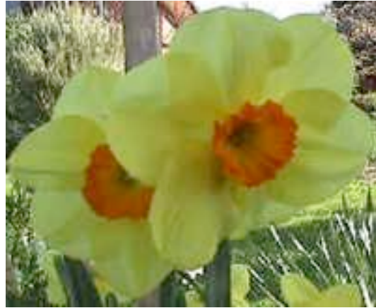
Figure 4. Spring blooming plants such as the daffodil provide an excellent signal for timing a preemergent crabgrass herbicide

preemergent herbicide treatment timing in the form of the following ornamental plants: daffodils, forsythia, and dogwoods (Figure 4). Prolific blooming of these spring plants is the period when preemergent herbicides should be applied for crabgrass and other summer annual weeds, with forsythia and daffodils being early in the window of application, and dogwoods being at the end of the recommended application period. There are several preemergent herbicides available for lawn applications and table 1 lists some of the most common products.