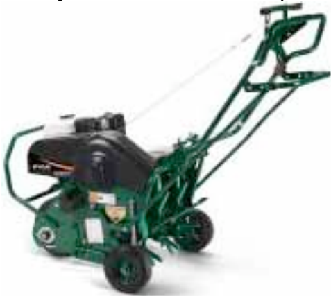
Figure 2. A walk-behind cultivating machine that is commonly used in lawn aeration.

will likely be under stress. Extensive core cultivation should be done in the late summer to early fall when the turf has optimum recuperative potential.