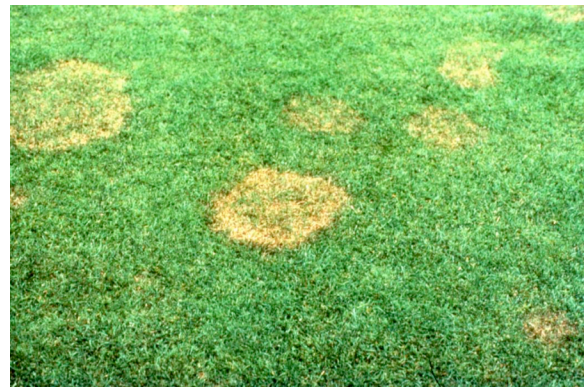
Figure 9. The characteristic “smoke-ring”-symptom of Rhizoctonia blight.