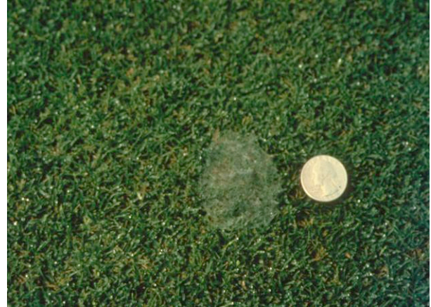
Figure 17. The characteristic web of the sod webworm visible in the early morning dew.

The non-target effects of any insecticide should be carefully considered before treatment because of the possibility that beneficial insects might also be controlled. Fortunately, many of the newest generation insecticides have greatly improved in their specific target pest and their safety in the environment. Apply insecticides only when damage (or potential damage) warrants treatment. If chemicals are necessary, Table 4 details some of the most popular chemicals recommended by Virginia Cooperative Extension entomologists for the major turf pests.