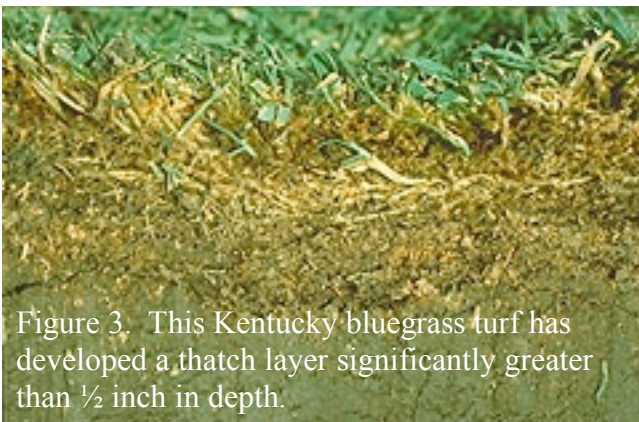
Figure 3. This Kentucky bluegrass turf has developed a thatch layer significantly greater than \frac{1}{2} inch in depth.

Vertical mowing. Vertical mowing is not a means of relieving compaction and improving soil aeration. Instead, it is an excellent technique to prepare the soil as a seed bed for spring plantings. A primary reason for vertical mowing is thatch removal (i.e. vertical mowing is often referred to as “dethatching”). Thatch (Figure 3), an organic layer predominantly comprised of living and decaying stems, signals an imbalance between the growth rate of the turf and how fast the plant material is broken down by soil microbes. Thatch depths exceeding \frac{1}{2} inch require attention because turfgrass roots living in the thatch suffer from moisture stress during dry weather, and many problematic insects and fungi find thatch a favorable environment for their development. However, surface disruption and damage to the existing turf will be extensive, and with the approaching summer months, vertical mowing is not recommended at this time.