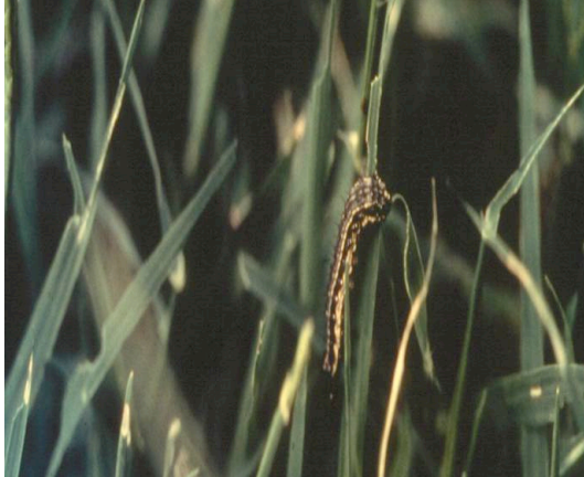
Figure 16. The characteristic notching pattern on the leaves as a result of feeding by the fall armyworm.

control. Since all of the caterpillars discussed here feed above ground, surface applications of insecticides are recommended.