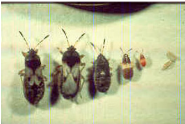
Figure 15. Upon hatching, all stages of chinch bugs can feed on plants with piercing, sucking mouthparts.

Any insecticide application should be carefully considered before treatment because of the potential for killing non-target, beneficial insects. In particular, it is not always necessary to treat for grubs because if only a few are present, their damage to turf is negligible. Scout the turf using a shovel to lift the sod in a one square foot area if you suspect grubs might be causing damage. Numbers of 6-10 grubs per square foot justify treatment for most grubs. Still, just because you see a few grubs when you are digging in your lawn and garden in the spring does not mean that you should chemically treat.