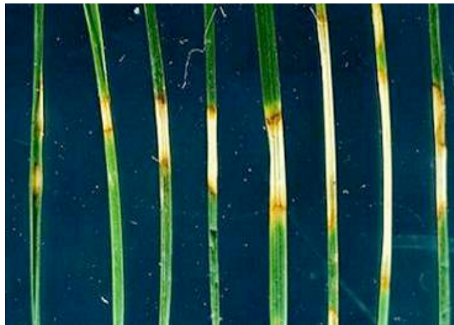
Figure 7. The characteristic “hour glass”-shaped lesions of dollar spot on unmowed Kentucky bluegrass.