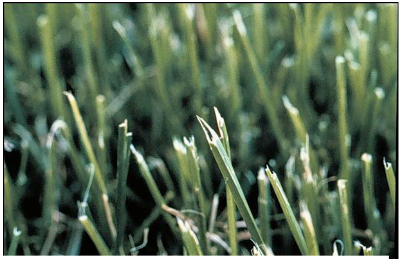
Figure 5. Tall Fescue is particularly susceptible to “dull mower disease”. Keep mower blades sharp to reduce this “disease”!

Information that is particularly useful includes patterns of the disease, symptoms or signs as seen in the field, chemical application history, and weather patterns when symptoms were first noticed. Providing digital images can also be very