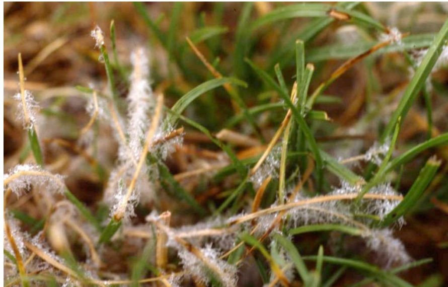
Figure 6. The cottony-like mycelia of dollar spot that often appears under heavy dew conditions in the morning.

Applications of nitrogen will not cure the disease, but allows the plant to “out grow” the disease. The cottony-like web of the fungus is clearly visible early in the morning when dew is present. Limited infections do not usually cause massive turf loss, but the plant can be weakened such that it is subject to serious environmental stress later in the summer. The physical sign of dollar spot is a cottony-like fungal growth that can be confused with webs spun by spiders or insects (Figure 6). To confirm the damage is caused by the dollar spot fungus, inspect the leaves for the characteristic hour-glass lesions as shown in Figure 7. Dollar spot is often an indication of low nitrogen