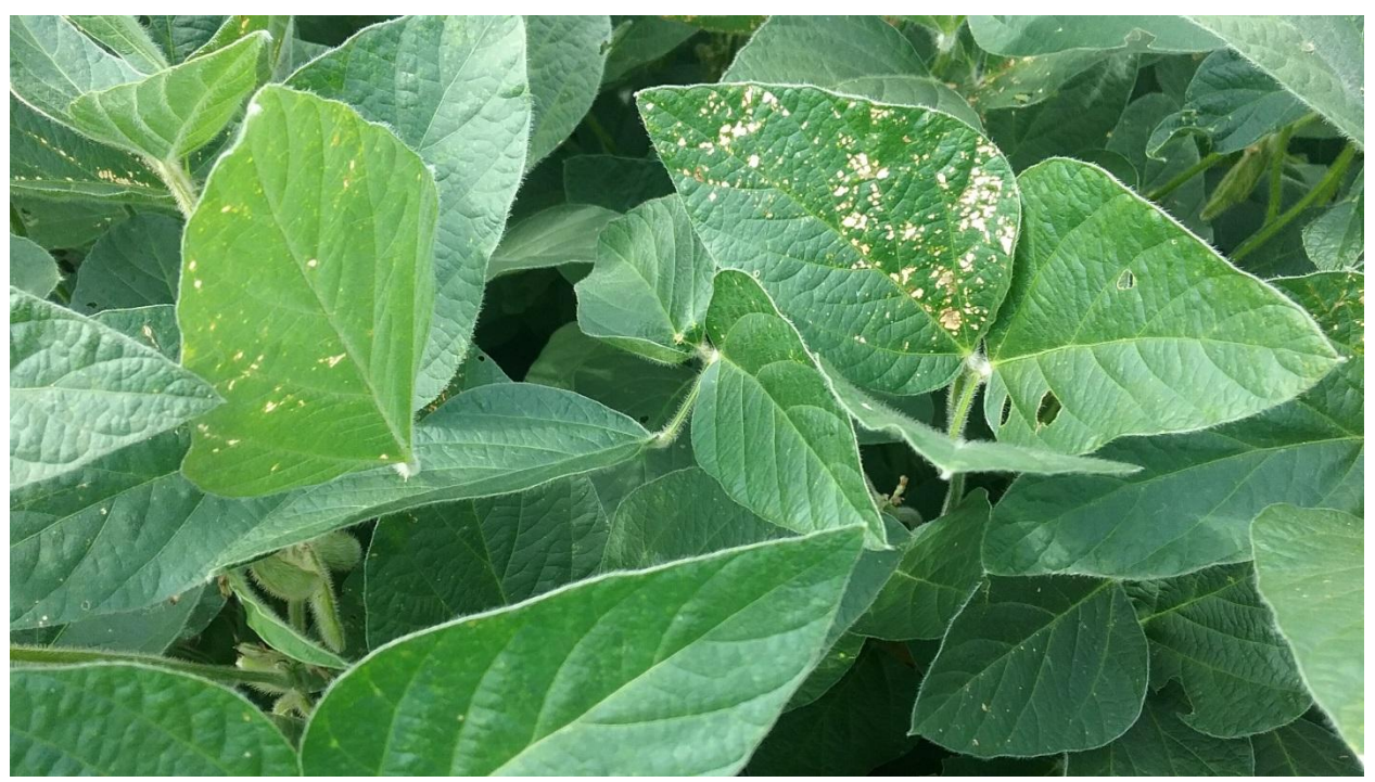
Figure 1. Foliar burn from foliar application of Potash.

The application did result in some phytotoxicity (leaf burn), but this was minimal and cosmetic in nature. See picture below.