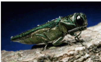
Adult Emerald Ash Borer

Officials are continuing to monitor movement of the exotic invasive Emerald Ash Borer (EAB), Agilus planipennis , in Virginia which reappeared in 2008 after an attempt to eradicate it following the initial 2003 infestation. There had been no documented spread outside of the quarantine since 2008.